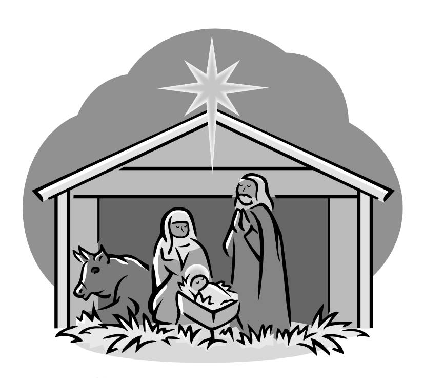
Christmas Magazine December 2013